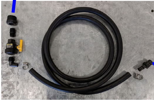
Inlet Plumbing Hose Kit (See page 4)