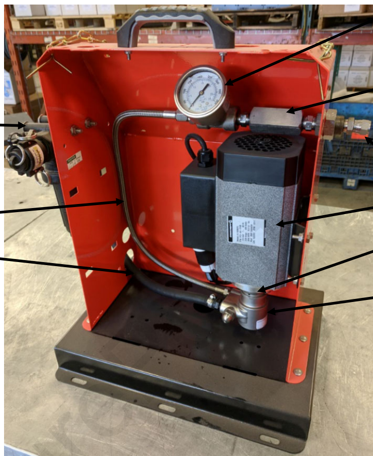
400 PSI Pressure Gauge PN: 137-LFG400-BM