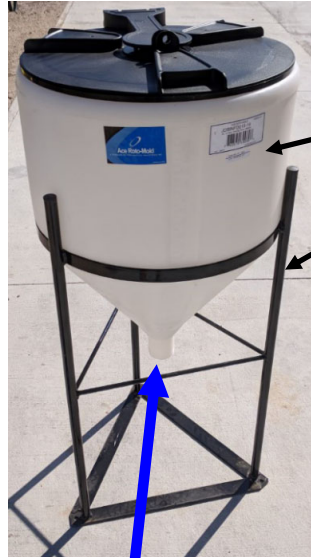
15 Gallon Cone Bottom Tank PN: 727-05-INFD15-19 Tank Stand PN:727-29-INFD15ST