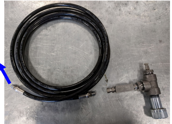
Discharge Hose Kit (See page 5)