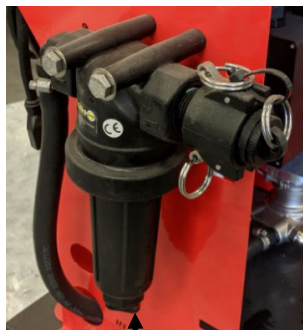
3/4" Strainer Assembly PN: 521-06-3704Y1