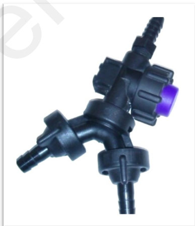
Optional fittings for splitting flow