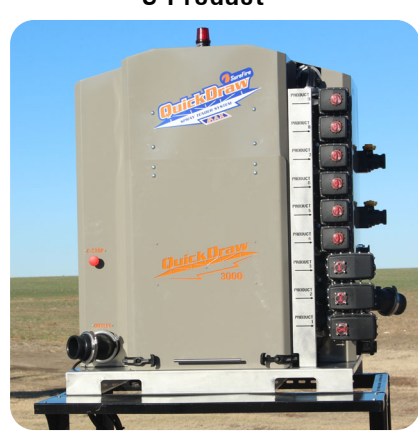
6 - 1" Port Valves, 3 - 1 1/2" Port Valve