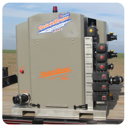
5 - 1" Port Valves, 1 - 1 ½" Port Valve